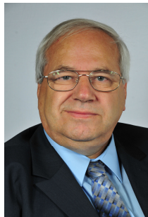
Mr Ian Chittenden Liberal Democrat Member for Maidstone North East